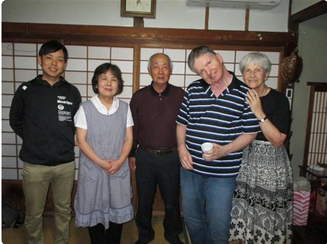
Lovely dinner in the home of Japanese friends.